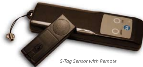
S-Tag Sensor with Remote

Our versatile S-Tags are self-alarmed units that alarm not only if product tampering occurs, but will also alarm at your EAS secured entrance. S-Tags are available in two options; adhesive and tethering. The adhesive version applies directly to your product or product packaging. The tether version threads through an opening on the product and secures within itself to conform to nearly any product design. A visual LED Indicator alerts potential thieves and store associates that the alarm is operating and acts as an additional visual deterrent to theft.