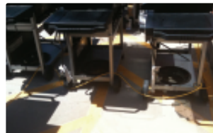
Alarm can be tethered to multiple items in a chain

pcn gc c tguuu u ggn r t cdng cp dc gt rgtc g grgc gtu ecp g h gce yd * cn e gtcig cp c cnu tg tce cdng prn i ecp gto pc g e ppge p c g gp h ecdngu