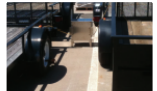
Alarm can be tethered directly to item